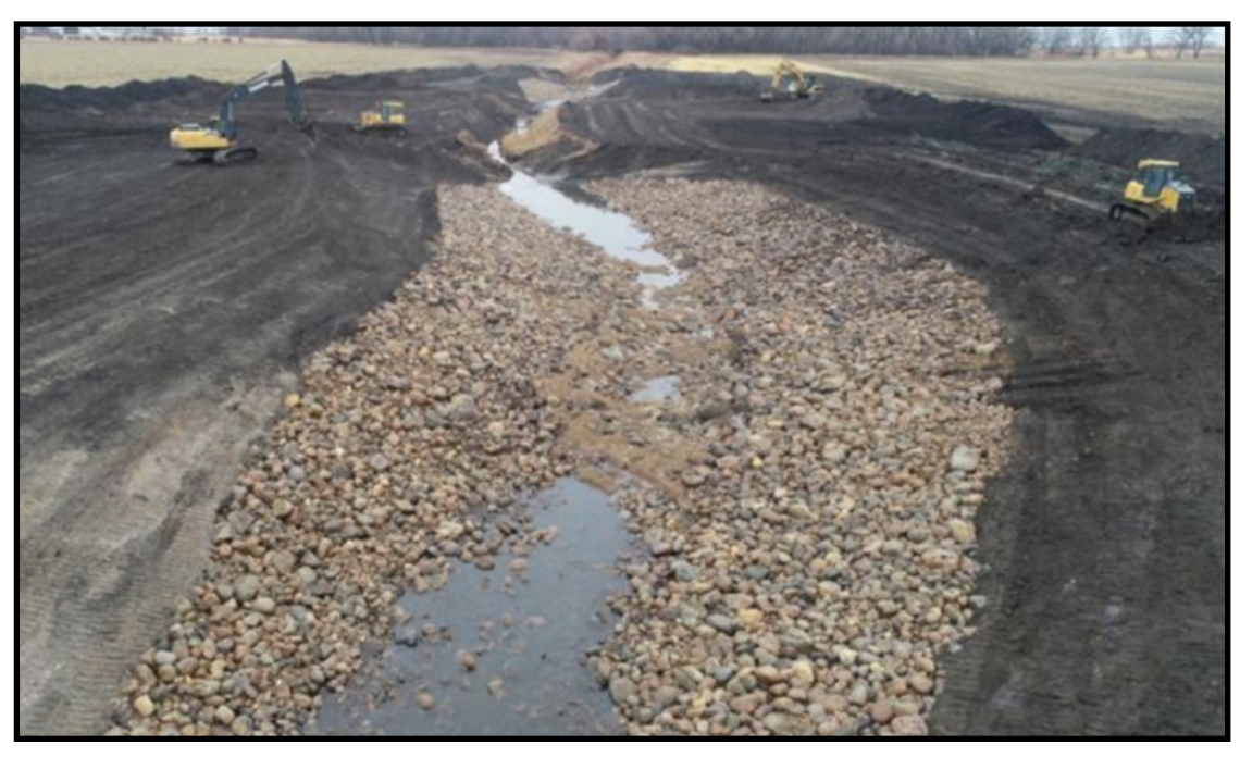
Phase 1 construction in November 2020.

While the Project is primarily focused on reducing erosion and sedimentation and augmenting fishery habitat, the project will work towards preserving flood storage in Lake Traverse by limiting the amount of sediment currently entering the Lake. Phase 1 also incorporates the use of four separate rock riffle areas that will contribute to fishery habitat and sediment management. Phase 2 will incorporate five additional riffle areas. The next three photographs illustrate construction, final placement of rock riffles, and stockpiles of various sizes of aggregate.