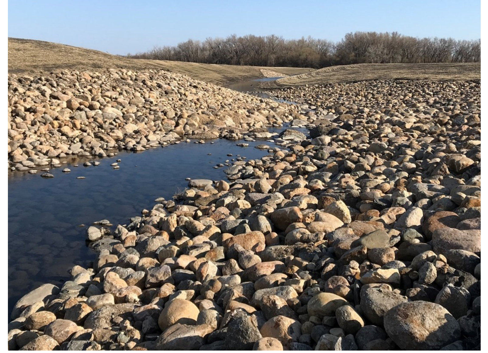
Close up view of a rock riffle in Phase 1. Photograph courtesy of Robert Sip, RRWMB Executive Director – April 22, 2021.

Jim Guler indicated that, "A variety of different sizes of aggregate have been used thus far ranging from small 3/4-inch chinking rock to five-foot wide boulders. Chinking rock is used for filling the voids of larger boulders and aids in fish passage. Jim also stated that, "Aggregate resources came from local sources and that the larger boulders were individually selected due to their size and shape for the specific purpose of creating stepped weirs".