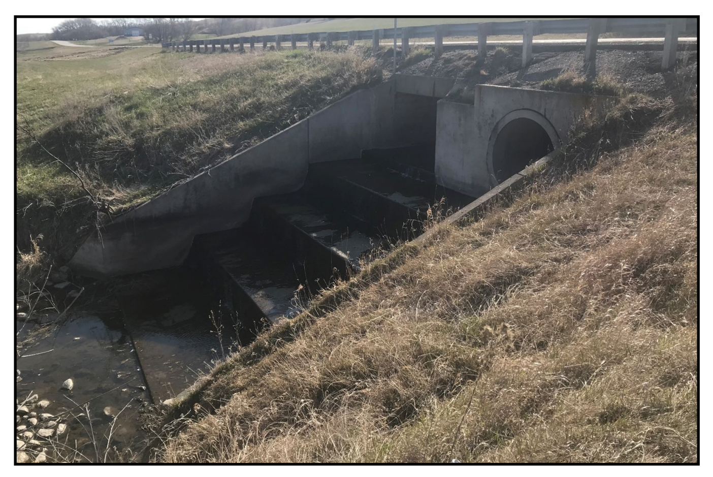
Minnesota State Highway 27 culvert. Photograph courtesy of Robert Sip, RRWMB Executive Director – April 22, 2021.

While the Project is primarily focused on reducing erosion and sedimentation and augmenting fishery habitat, the project will work towards preserving flood storage in Lake Traverse by limiting the amount of sediment currently entering the Lake. Phase 1 also incorporates the use of four separate rock riffle areas that will contribute to fishery habitat and sediment management. Phase 2 will incorporate five additional riffle areas. The next three photographs illustrate construction, final placement of rock riffles, and stockpiles of various sizes of aggregate.